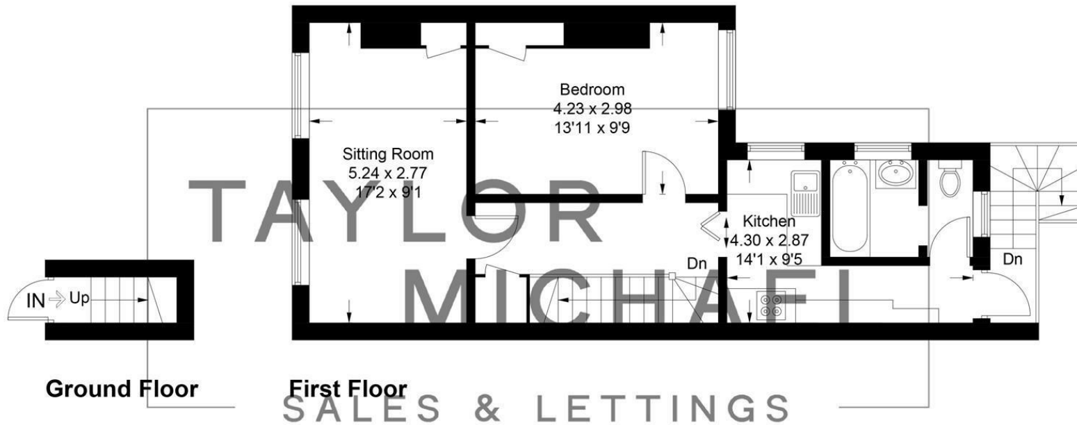
Illustration for identification purposes only, measurements are approximate, not to scale. Imageplansurveys @ 2025